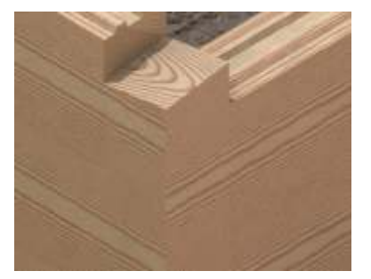
Corner of an external wall with a dovetail interlocking corner without remiants.