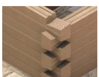
Log dovetail notch with remaints