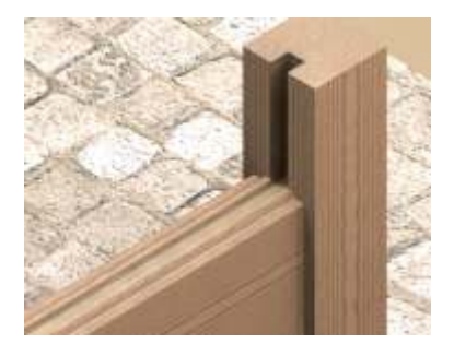
Pole-beam connection protecting the doors and windows from building settlement.