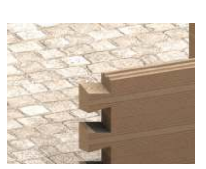
Log dovetail notch without remaints