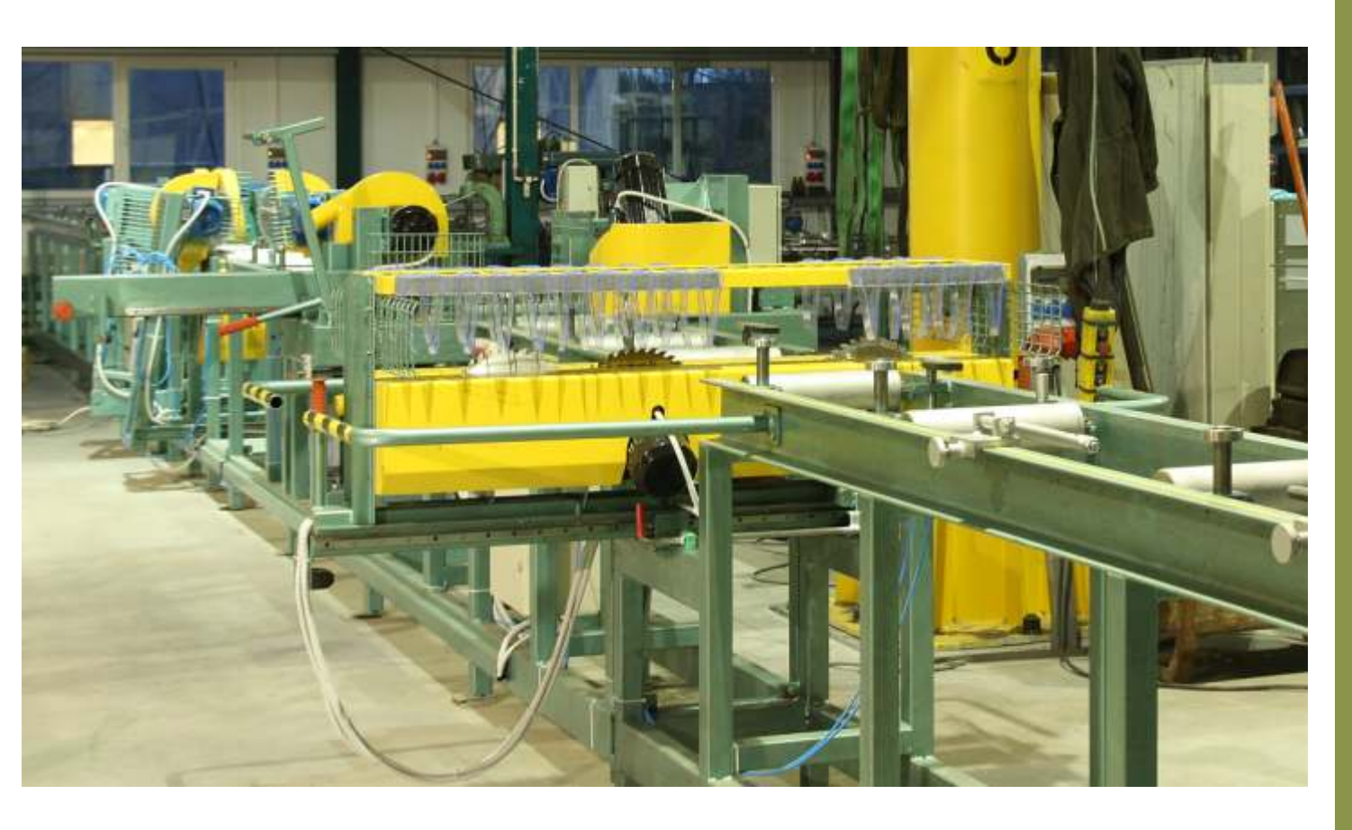
"Dovetail" notch line

The line is designed to make dovetail notches. All notches are made with circular saws which guarantees very high quality and precision of cuts. The line forms a necessary part of equipment for production of log houses.