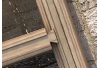
Connection of external wall with internal wall with use of half-interlocking dovetail.